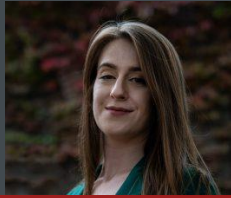
Hayes & Serbic (2024)